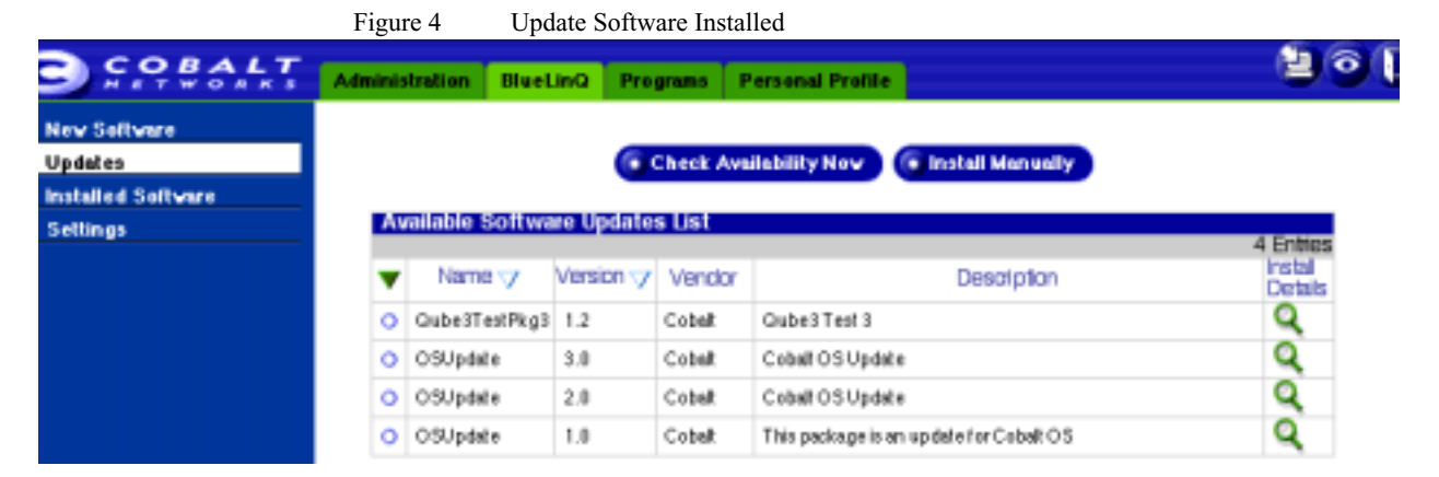
Figure 4 shows the Update Server page.

If you click on the magnifying glass, you see the information shown in Figure 5, shown in Figure 3, which corresponds to the information in Table 3, Package List Format, on page 8.