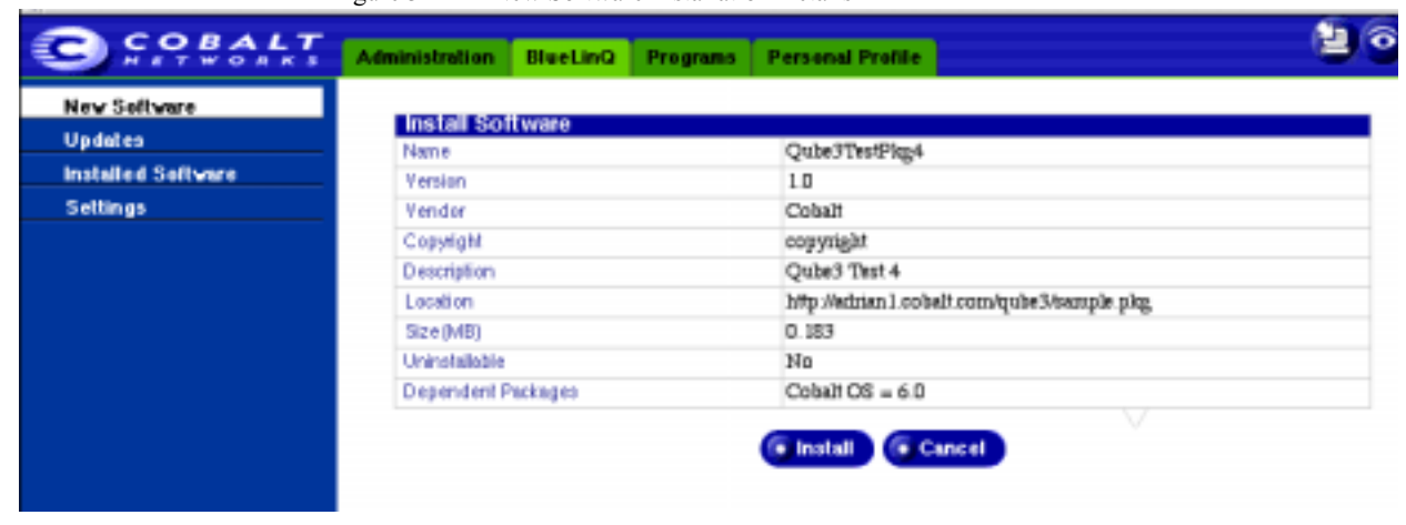
Figure 3 New Software Installation Details

• If you click on the magnifying glass, you see the information shown in Figure 3, which corresponds to the information in Table 3, "Package List Format," on page 8.