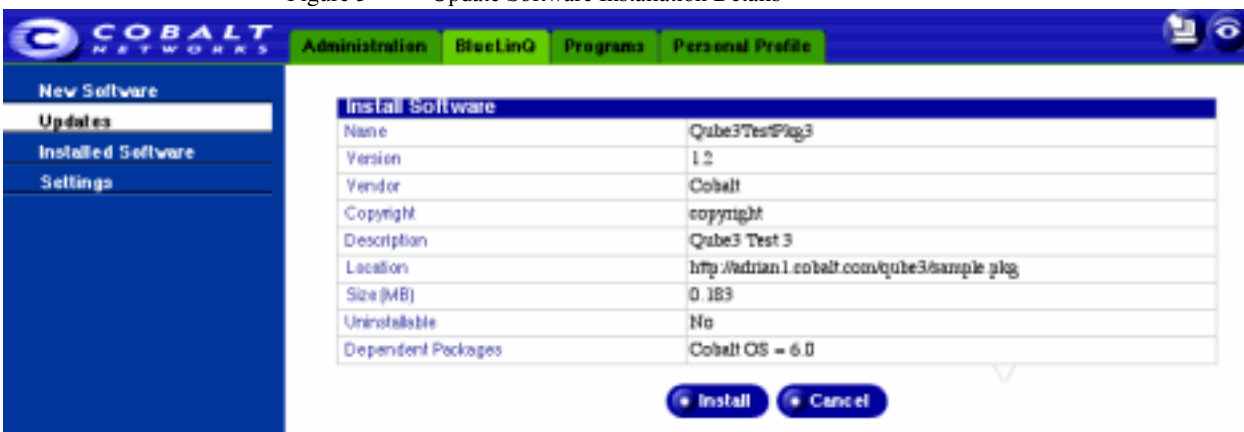
Figure 5 Update Software Installation Details

If you click on the magnifying glass, you see the information shown in Figure 5, shown in Figure 3, which corresponds to the information in Table 3, Package List Format, on page 8.